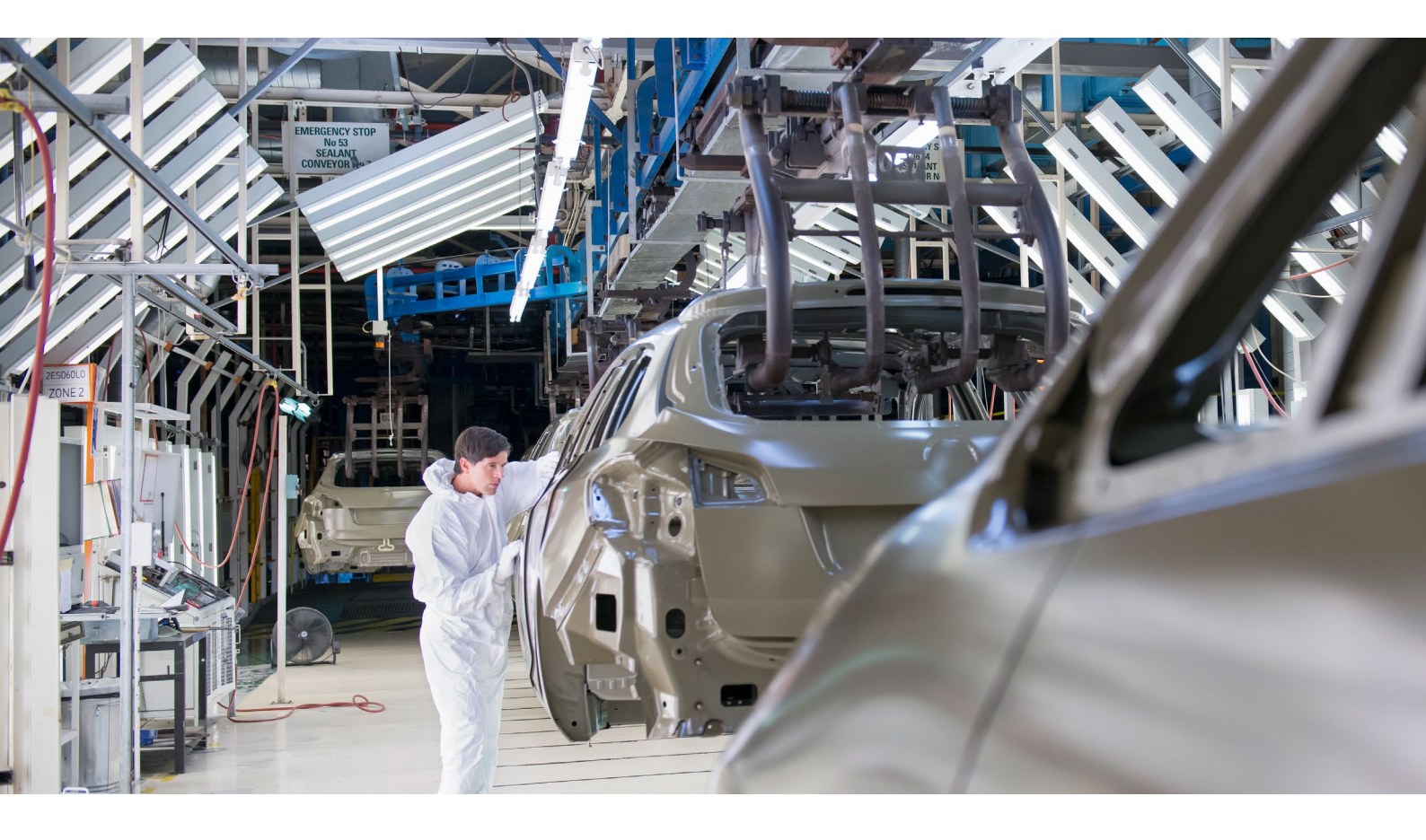
Figure 1: a little less in sync?